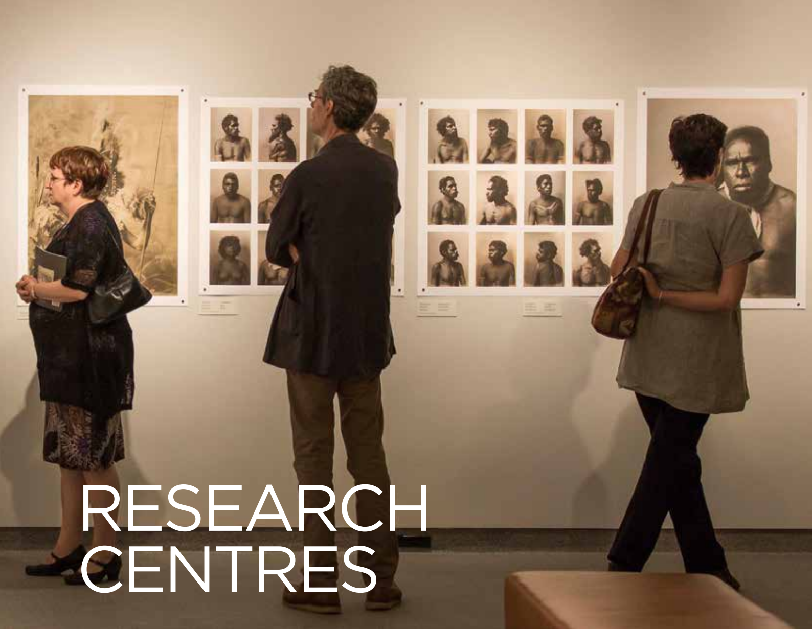
Wild Australia Show exhibition, UQ Anthropology Museum. The AERC heads an ARC Linkage grant investigating the show's history.

The School of Architecture hosts two established, world-class research centres that are internationally recognised for a diverse range of research projects that address the physical, social and historical aspects of architecture.