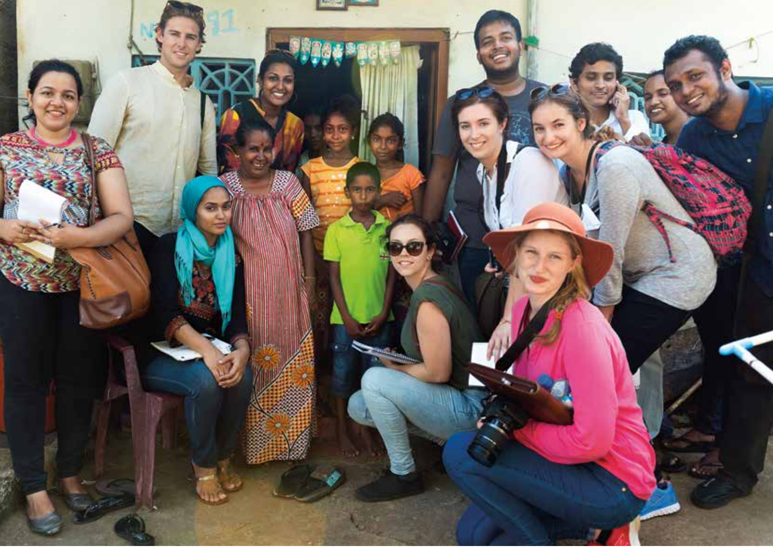
BArch design students in Colombo Sri Lanka on a New Colombo Plan research field trip with students from the City School of Architecture documenting an informal settlement in 2015.