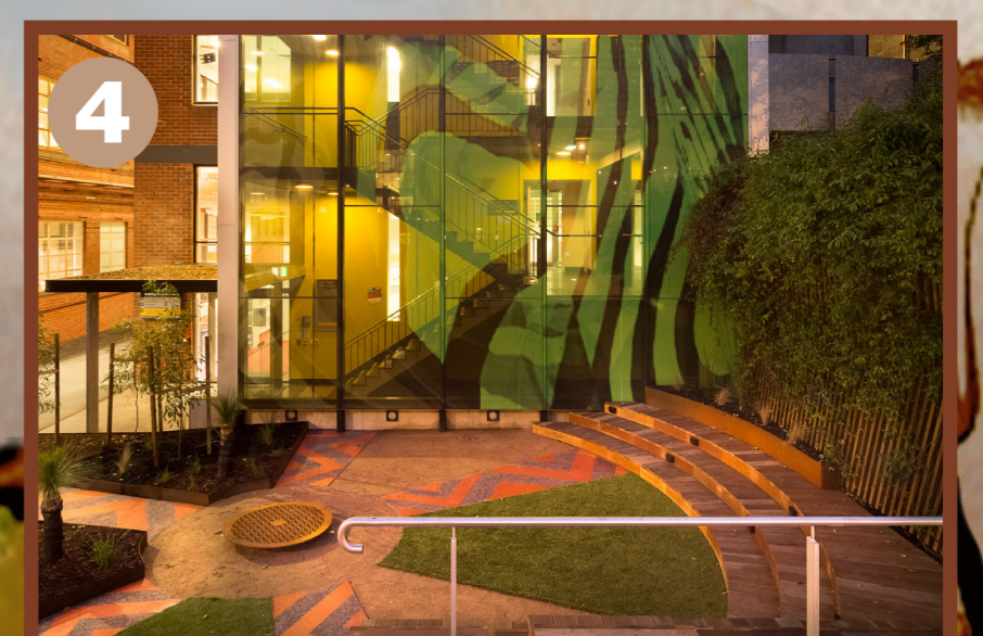
Etched Paving Graphic and Mural Artwork