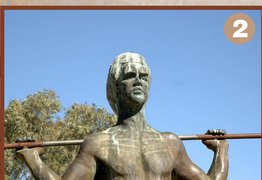
Billy Barlow Sculpture