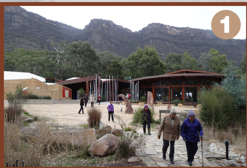
Aboriginal Themed Cultural Corridor